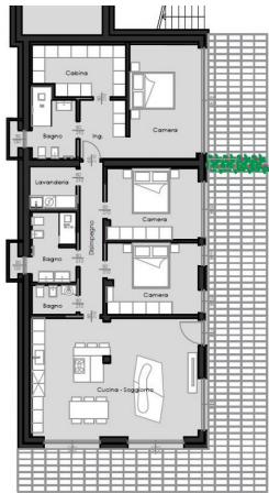
Pianta piano terra arredato - scala 1:100