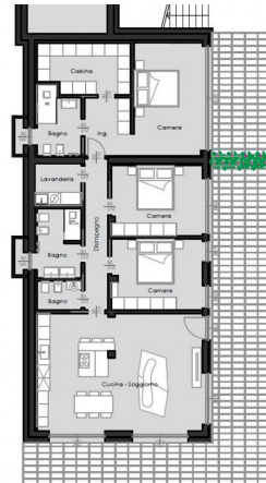
Pianta piano terra arredato - scala 1:100